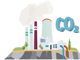
Carbon Management and Gas Transition