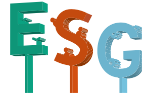
Environmental, Social and Governance (ESG)