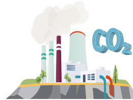
Carbon Management and Gas Transition