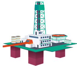
Oil and Gas

Our portfolio, offered at all experience levels, covers the entire breadth and depth of the energy mix. Our faculty of independent expert instructors come from a wide variety of technical background and regional experience that allows RPS to bring world class expertise to address your skills and training requirements. Choose from the wide range of courses, in various subject areas and disciplines, learn best practices, and gain hands-on experience that will improve performance.