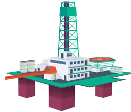
Oil and Gas

Choose from the wide range of courses, in various subject areas and disciplines, learn best practices, and gain hands-on experience that will improve performance.