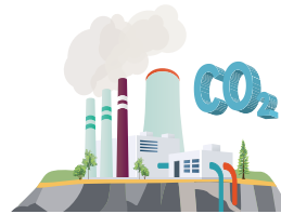
Carbon Management and Gas Transition