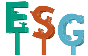
Environmental, Social and Governance (ESG)