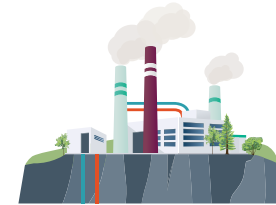
Sustainable Heat - Geothermal