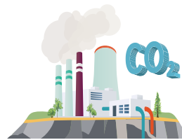
Carbon Management and Gas Transition