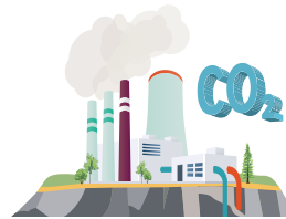
Carbon Management and Gas Transition