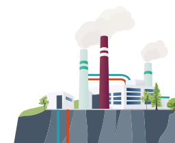
Sustainable Heat - Geothermal