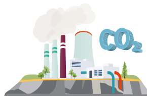
Carbon Management and Gas Transition