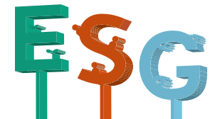
Environmental, Social and Governance (ESG)